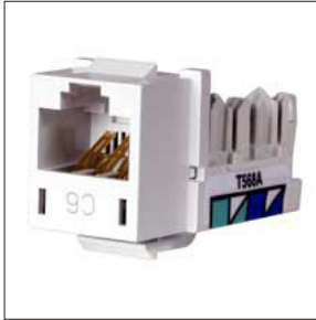
HXJ6OW JACK HXJ CAT6 - Office white