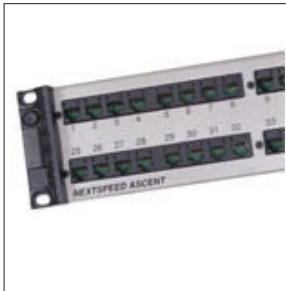
P5E24UE PATCH PANEL 24 PORT UNIVERSAL - 19" Rack mount