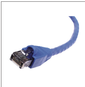
PCX6B03 CAT 6 PATCH CORD - Blue - 3 ft