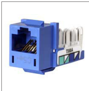
HXJ5EB JACK HXJ CAT5E - Blue