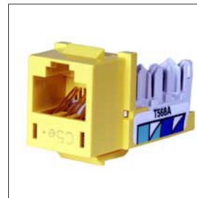
HXJ5EY JACK HXJ CAT5E - Yellow