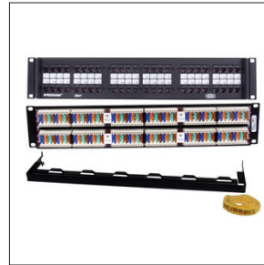
P5E48U PATCH PANEL 48 PORT UNIVERSAL - 19" Rack mount