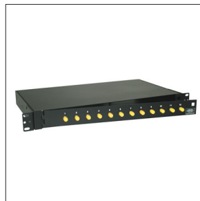
FPR012STM RACK MOUNT PANEL, 12 ST-STYLE ADAPTERS SM/MM, LOADED - Capable of flush or center mounting in a rack or cabinet - The FPR series panels accept a maximum of two 10" splice trays - Pre-punched or FSP Adapter Panel versions available - Hinged swing-out fiber drawer for easy access to cables and connectors