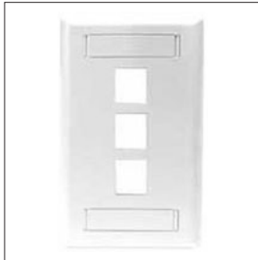
IFP13W 3 PORTS 1 GANG FIXED PLATE - White