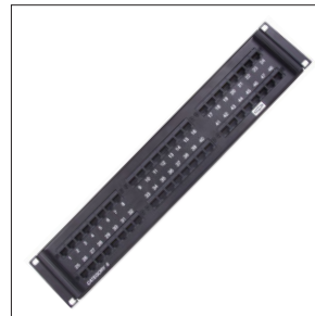
P648U 48 PORT CAT 6 UNIVERSAL WIRED PANEL - 19" Rack mount