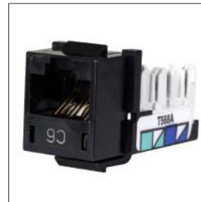
HXJ6BK JACK HXJ CAT6 - Black