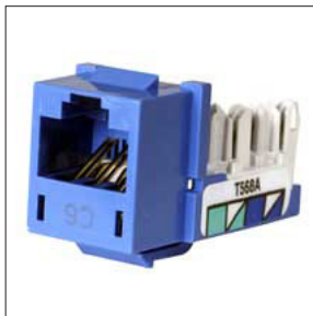
HXJ6B JACK HXJ CAT6 - Blue