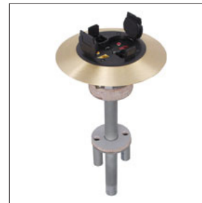
SCRUBSHIELD POKE THROUGH (FLOOR MOUNT)