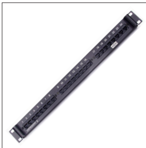
P624U 24 PORT CAT 6 UNIVERSAL WIRED PANEL - 19" Rack mount