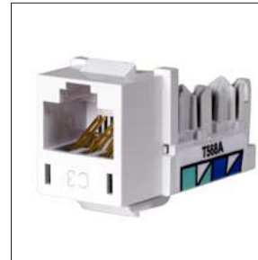
HXJ3W JACK HXJ CAT3 - White