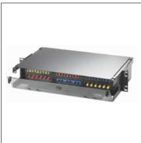
FCR350SP36R RACK MOUNT PANEL, 3.5"H, 6 FSP ADAPTER PANELS - Patented "gasket-less" internal routing knock-outs - Mounting stud accepts splice trays or blown fiber brackets - Fits 19" or 23" racks - capable of flush or center mounting in a rack or cabinet - Quick release latches on front cover/tray