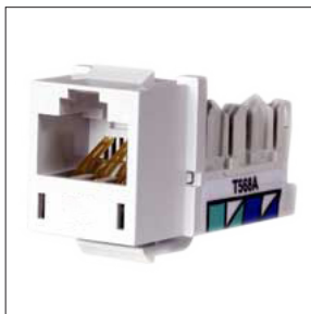
HXJ5EW JACK HXJ CAT5E - White