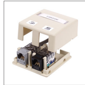
ISM2W HOUSING 2 PORT - White - Surface mount