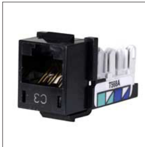
HXJ3BK JACK HXJ CAT3 - Black