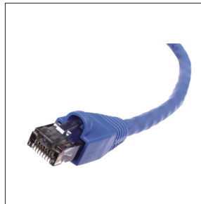
PCX6B06 CAT 6 PATCH CORD - Blue - 6 ft