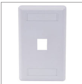
IFP11W 1 PORT 1 GANG FIXED PLATE - White