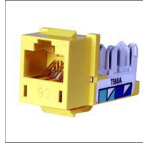
HXJ6Y JACK HXJ CAT6 - Yellow