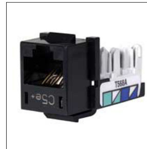
HXJ5EBK JACK HXJ CAT5E - Black