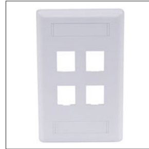
IFP14W 4 PORTS 1 GANG FIXED PLATE - White