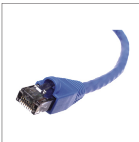
PCX6B10 CAT 6 PATCH CORD - Blue - 10 ft