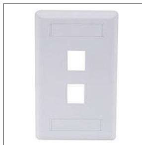
IFP12W 2 PORTS 1 GANG FIXED PLATE - White