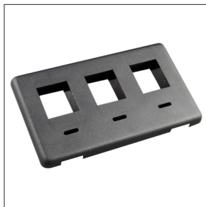
NTL-3FM FLUSH MOUNT FURNITURE PLATE