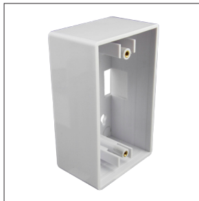
NTL-JE318 SURFACE MOUNT BOX - Single gang