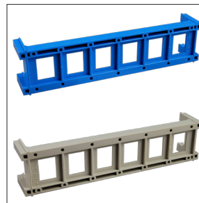
NTL-1AKEYSTN-BL NTL-1AKEYSTN-NA "THE HYBRID" - Universal keystone mount - Holds 6 keystone inserts - Blue and Natural Colour - Snaps into NTL-10A, NTL-10B, NTL-10C - Makes a great mini patch panel - Snap in keystone, CAT5E, CAT3, Coax, even one inserts