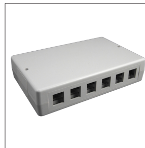
NTL-S6/12 SURFACE MOUNT KEYSTONE BOX - 6 or 12 position