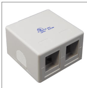
NTL-S2-TL SURFACE MOUNT KEYSTONE BOX - 2 position