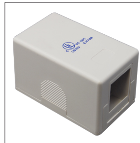
NTL-S1-TL SURFACE MOUNT KEYSTONE BOX - 1 position